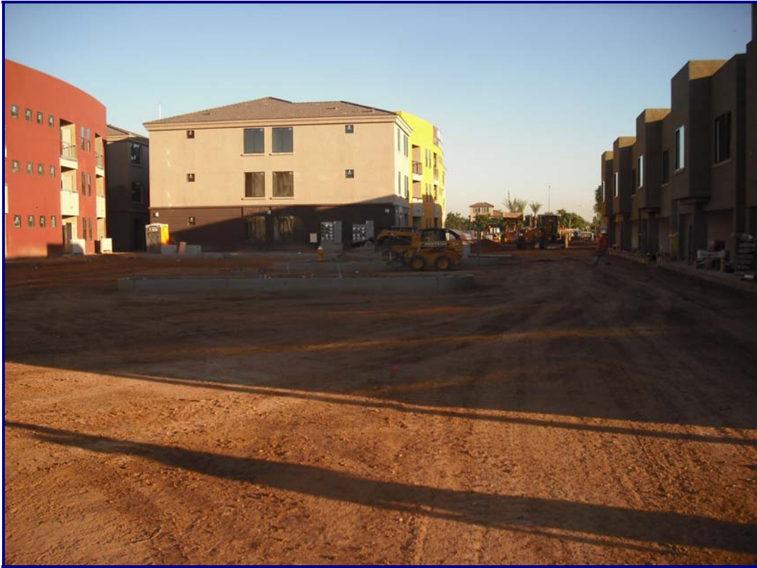
The picture above was taken before Phase 1 paving started at INDIGO at THE PARK on October 28th.