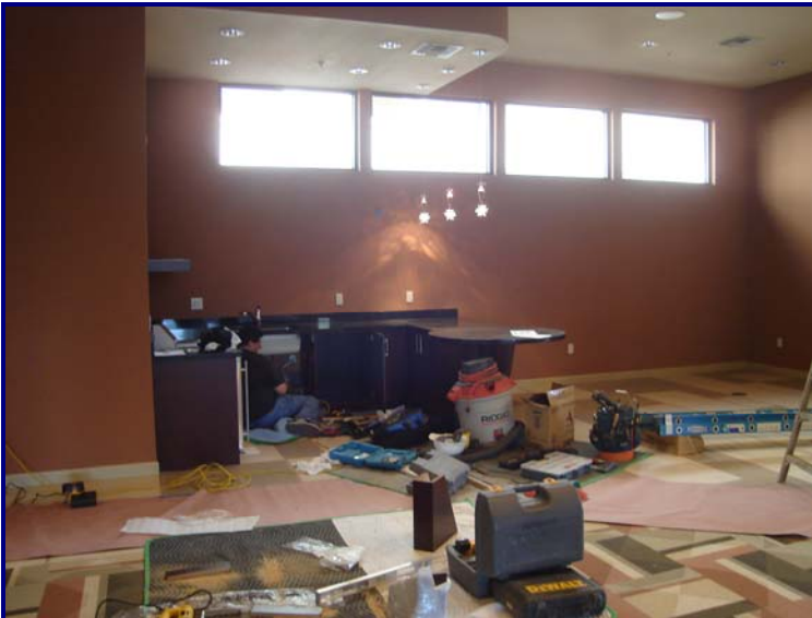
Above and right: the lobby area of Barossa at Trianna.