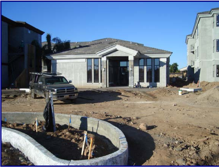
Barossa at Trianna starts to take shape.