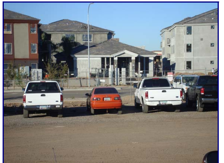
Barossa at Trianna's Clubhouse, as viewed from the construction trailer.