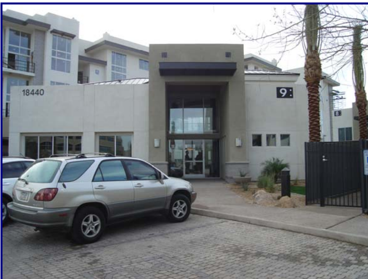
The front exterior of Ninety Degrees at Paradise Ridge.