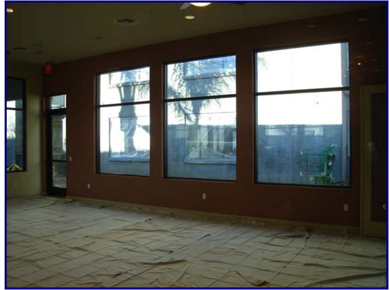
Barossa at Trianna's future Fitness Center.